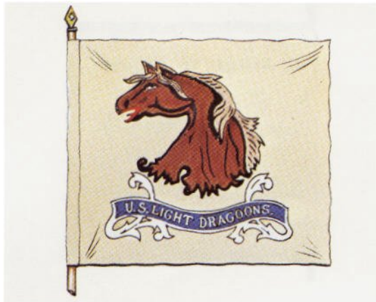
Guidon believed to have been carried by the Legion about the time of Garden's service; currently in the possession of Sons of the Revolution of the Commonwealth of Virginia.

the only persons found on the premises. These he parolled [sic] and returned without molestation. 43