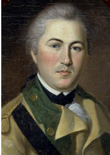
Lieut. Col. Henry Lee by Charles Wilson Peale (1741-1827)